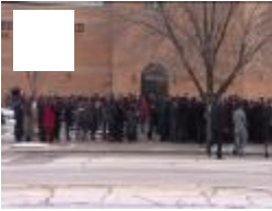
Supporters gather outside Pendleton funeral